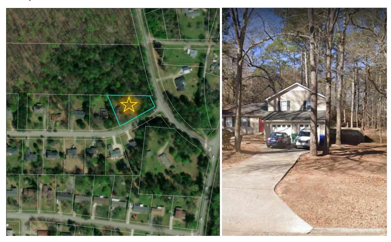
Submitted Site Plan-